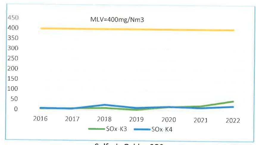
Sulfuric Oxides SO2